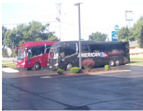
The New Bus Arrives

It is impossible to actually express the immenseness of the Ark. The volume is incredible, and one can easily understand, using the model of taking two or seven of each KIND , and taking young ones, how Noah could have fit all those animals in the Ark. Noah and his family would have had their hands full taking care of them but using the technology they most likely had available, and God's help, The Ark Encounter shows, in detail, how it could have been done with models and exhibits.