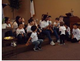
The Children Shall Lead

Music for the worship service was provided by all sections of the Children's Sabbath School, from the Beginners to the Junior classes. Leading the hymns as well special musical selections, they showed themselves not only capable but willing and enthusiastic.