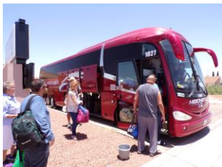
Outbound – June 11 th , 2022

This article is continued on Pg 3 of this issue.