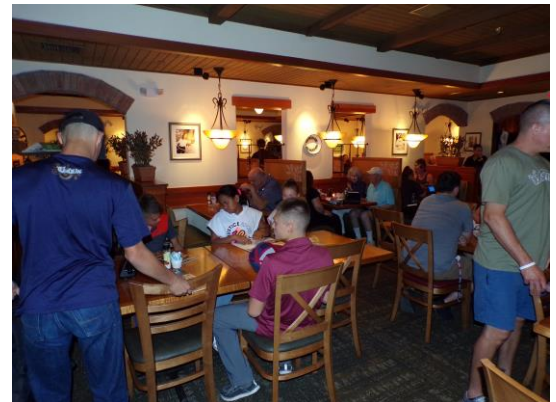
The Fellowship Meal

The Ark Committee had decided early in the planning process to hold and pay for a group fellowship meal before we came back to El Paso to let everyone share their impressions and ideas for the future. The Olive Garden in Florence made last-minute arrangements for our party of 41 and did a fantastic job for us. We had 3 servers dedicated to our group and they cleared a large party room for us with just minutes to spare. The Soup, Salad and Bread-sticks was the big winner that evening as well as all those who came to dinner.